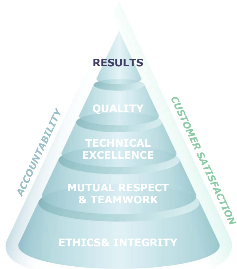
netNumina Core Values